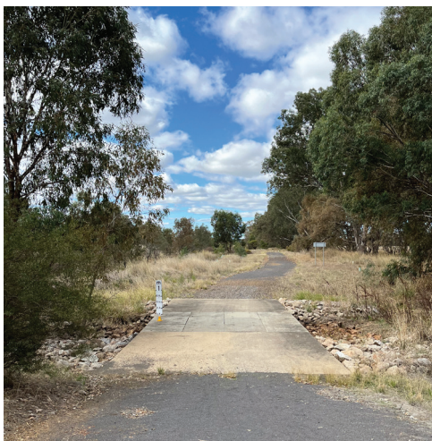
Mokoan Discovery Trail.

Council is set to begin community engagement on the Holland Bio Link Management Plan starting with adjoining landholders this month, before extending the opportunity to provide input to the wider community.