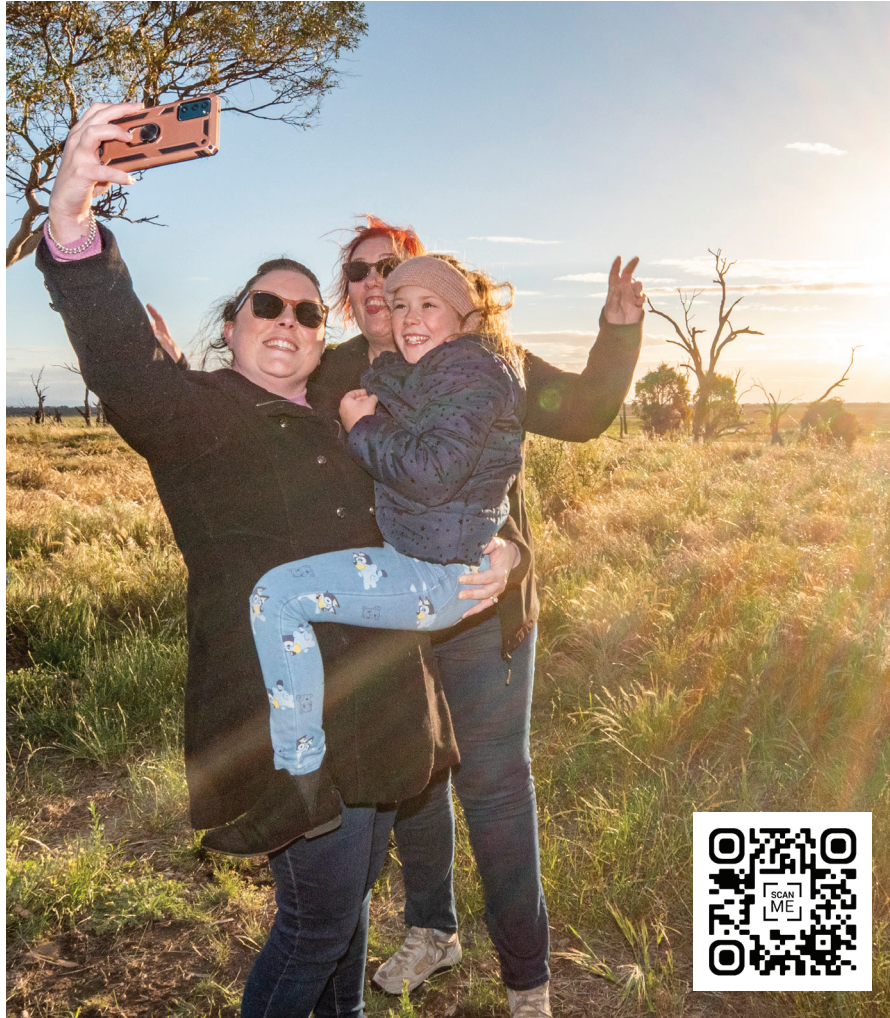
Have your say on the development of a future tourism plan for Benalla Rural City.

For more information, please contact the Council's planning team on 03 5760 2600.